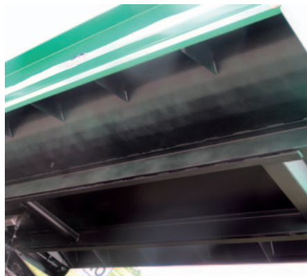
Standard I-Beam understructure.