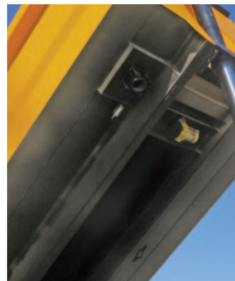
Heated I-Beam understructure.