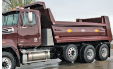
Sloped front toolbox.