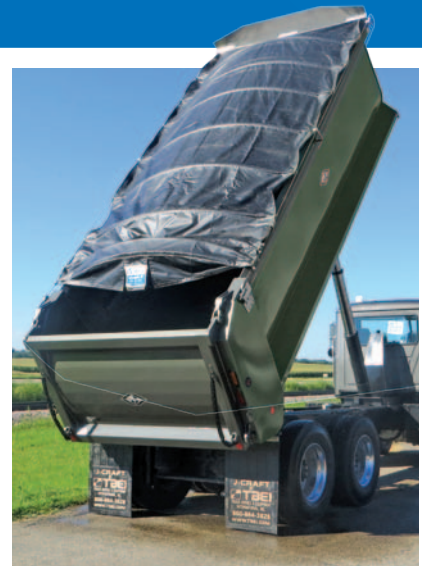
Electric cable tarps.