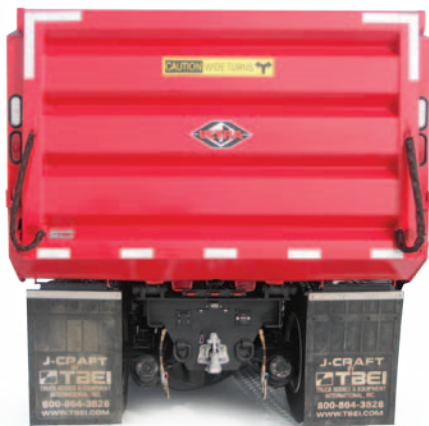
Traditional (full rib) double wall tailgate features easy operation.