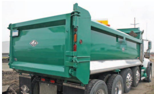
Straight rear with barn door tailgate.