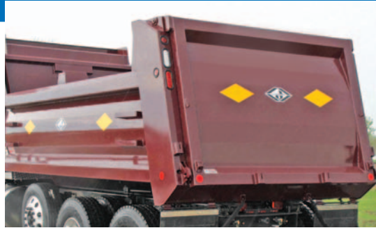
Asphalt tailgate eliminates the need for a spreader apron and allows you to pull away from the paving unit while the body is raised.