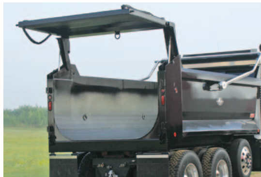
Power tailgate creates an opening 18" higher than tailgate itself.